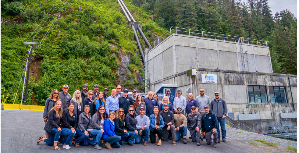
2025 CVEA SAFETY DAY