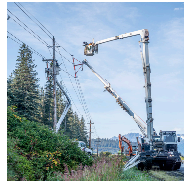
2025 DUCK FLATS POLE & LINE REPLACEMENT PROJECT

During the summer, CVEA meets most of its demand with hydropower, but winter generation remains challenging, with 70% of winter needs met by fuel. Reducing reliance on diesel is therefore a strategic priority. CVEA has progressed on a power-exchange project with Alyeska Pipeline Service Company at the Valdez Marine Terminal. Power was successfully exchanged with one unit in late 2025, and the commissioning of the remaining two units is scheduled for late spring, reducing future winter diesel use. The Solomon Gulch Pool Raise Project costs have been updated, and the project has been placed in the State of Alaska funding queue. We also provided an update on several alternative technologies within our service area.