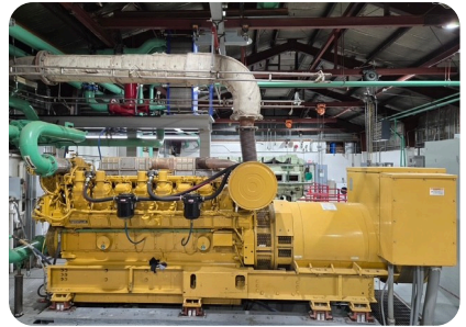
GLENNALLEN DIESEL PLANT ENGINE 8 OVERHAUL