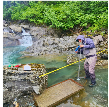
PLANT OPERATOR GAVIN BLOOD VALDEZ GAGING AT SOLOMON LAKE

System reliability, measured by outage hours, reached its lowest level in over 15 years. We attribute this improvement to a range of maintenance efforts across the Operations and Power Generation departments and an aggressive Right-of-Way Clearing Program. In 2025, CVEA cleared 65 miles of distribution line and 12 miles of transmission line utilizing both in-house and contractor crews. A significant milestone was completing two major system improvements in Valdez: the Duck Flats and Dayville Road Projects. Power plant work remained a priority, including a major overhaul of a Glennallen diesel unit, upgrades to Valdez diesel plant pressure monitoring systems, and testing of all 12 generators. While diesel supplies roughly 10% of our energy needs, it remains essential for keeping the lights on.