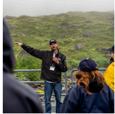
2025 CVEA MEMBER TOUR

I look forward to reflecting on our 2025 accomplishments, updating you on current issues, and sharing our priorities for 2026 at the Annual Meeting of Members on May 5, in Valdez, and May 7, in the Copper Basin.