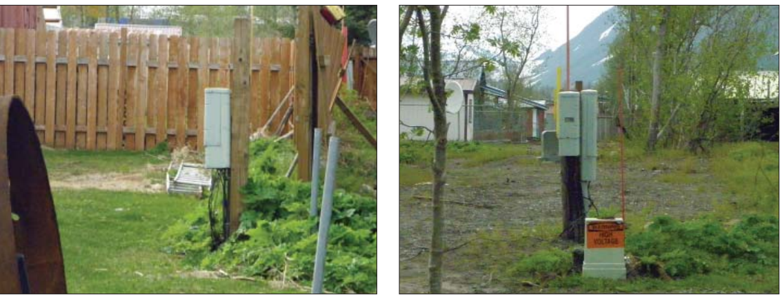
Above, two CVEA rights of way (ROW); the left has many objects in the ROW and might impede quick response if access is needed, the one on the right has been cleared as part of the ROW maintenance program