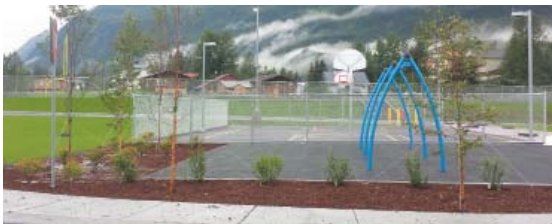
The outdoor basketball court and playground equipment