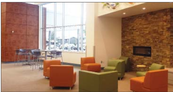
The new lounge is sure to be a student favorite