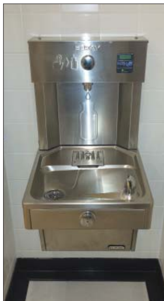
Water bottle filling stations; as requested by students