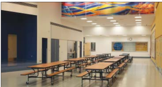
Grand entryway and lunch area displaying new artwork