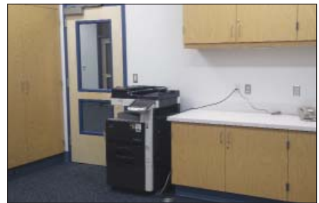
The Business Center for students