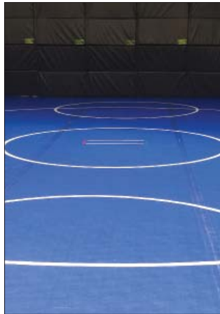
Wrestling room with permanent mats and rock climbing wall