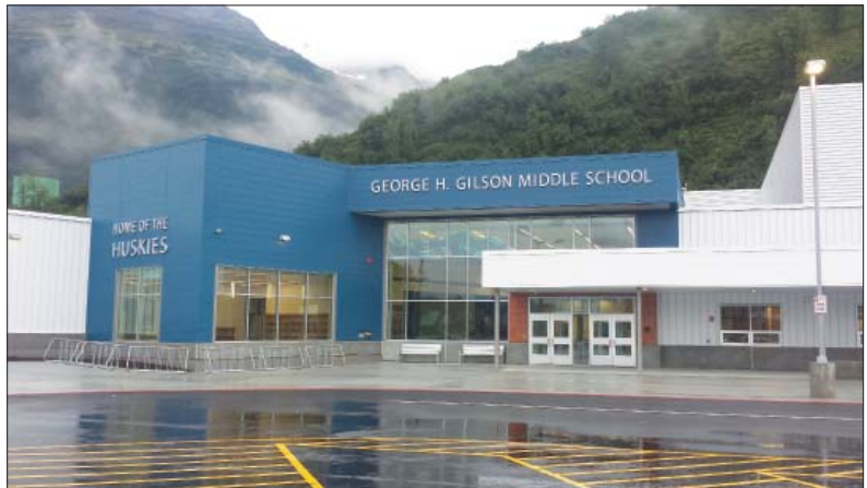
Front entry of the new Gilson Middle School building