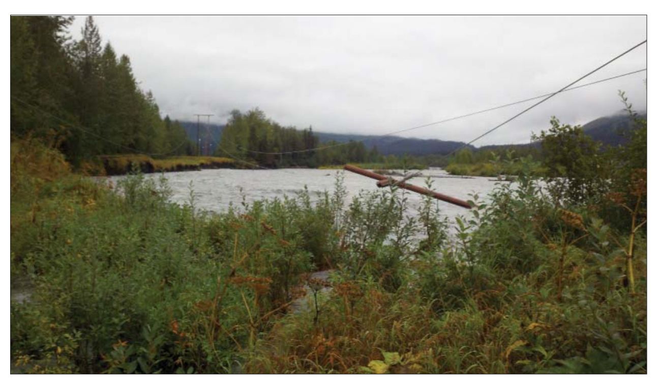
A crossarm dangles above the Lowe River in the area where Structure 38-7 stood prior to being destroyed by the Lowe River

At approximately 11:45 p.m. on Friday, September 6, a power outage ensued affecting all CVEA members from Heiden View, just outside of Valdez, to the Copper Basin. Copper Basin members were without power for roughly 80 minutes, while Heiden View remained out for over five hours.