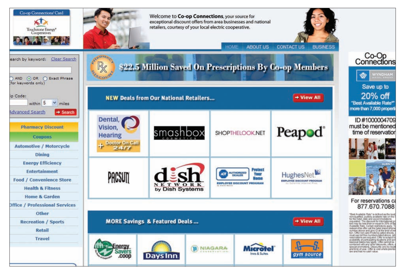
Screenshot of the connections.coop website showcasing discount and member offers, including the search feature and categories on the left side of the web page that allows you to find local and national merchants who accept the card and offer you benefits.

Finally, a pharmacy discount allows CVEA members to start saving money on prescription medications. While it is not insurance, the discount can mean savings of 10 to 60 percent on prescription drugs. The logo and information on the back of your card is recognized at more than 60,000 national, regional, and local pharmacies; including the Village Pharmacy of Valdez and Cross Road Pharmacy in Glennallen.