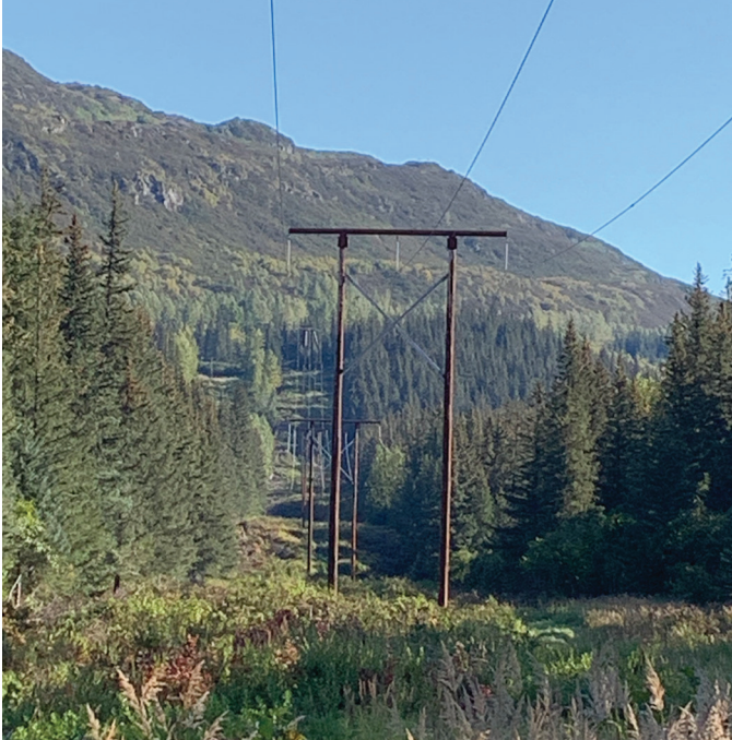
Pg. 4 Boring at Ptarmigan Drop for the Stuart Creek Project. Pg. 5 Top, repainting the stator during the Cogen generator project. Pg. 5 Middle, crushed walnut shells used for generator cleaning. Pg. 5 Bottom, pistons removed as part of the VD4 overhaul. Top, the Cogen generator rotor going back into the stator. Above, right-of-way clearing on the transmission line.