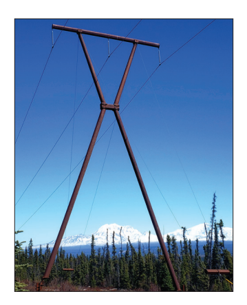
X Marks the Spot