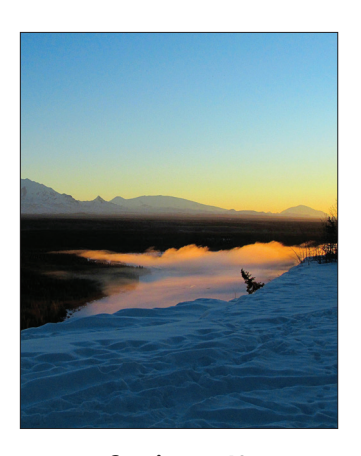
Sunrise at -40

Again, congratulations to all the winners and thanks to everyone who participanted in the 2021 Ruralite Cover Photo Contest. ■