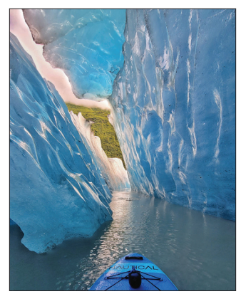
Berg Garden Blues