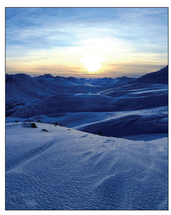
View From the Top