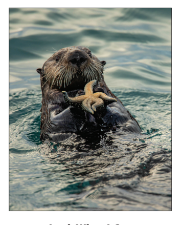
Look What I Got