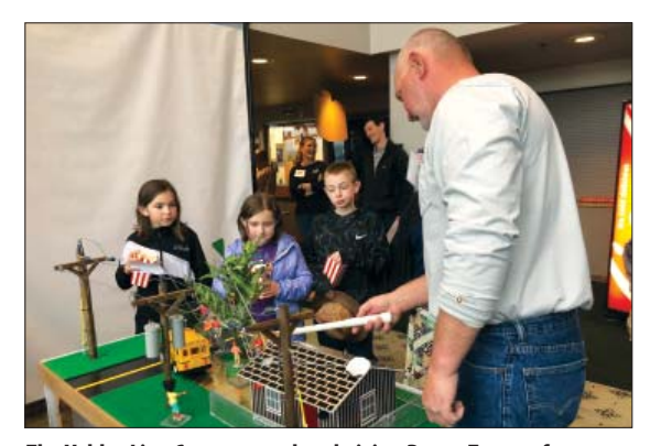
The Valdez Line Crew was on hand giving Power Town safety demonstrations