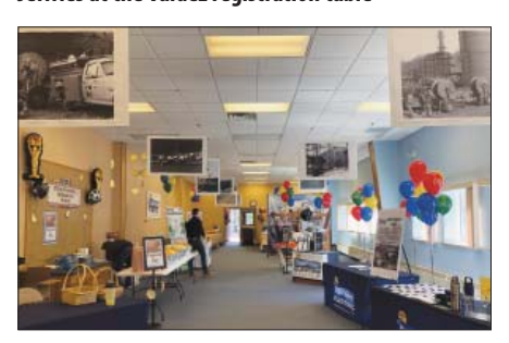
An early glance at all the fun that awaited members in Glennallen