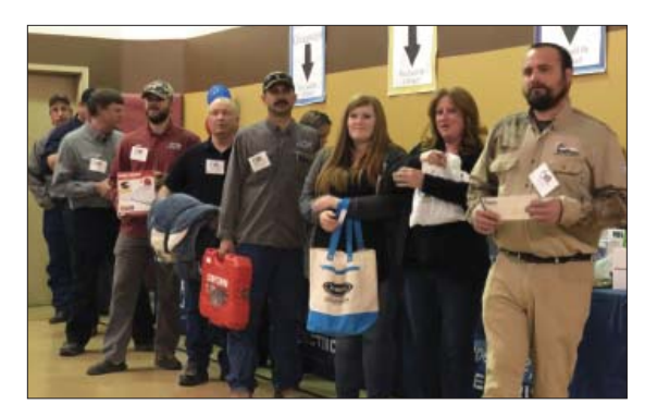
CVEA employees ready to distribute door prizes to members at the Copper Basin meeting