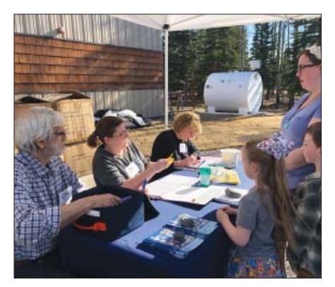
Members going through registration at the meeting in Glennallen