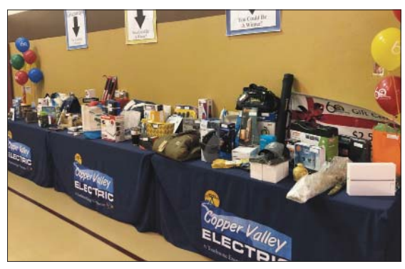
100 door prizes were given away in each district at this year's annual meeting