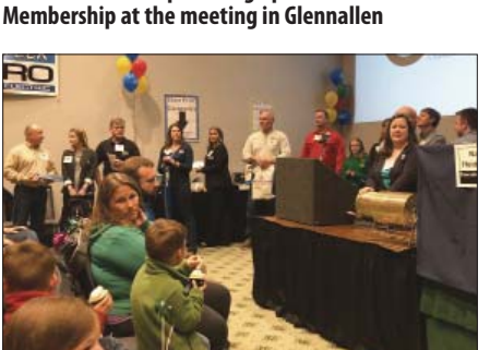
Employees line up for door prize distribution at the Valdez meeting; a favorite part of the evening