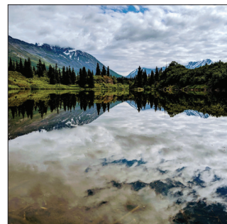
A Good Catch Water's Edge Layers of Reflection