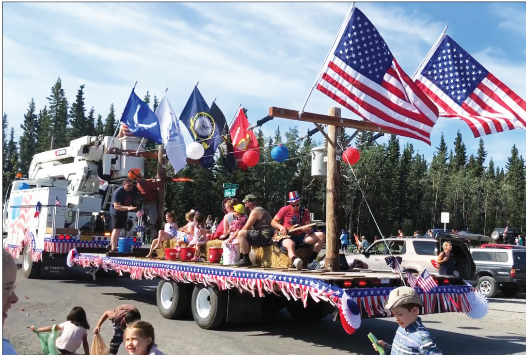
Independence Day Parade in Glennallen

Publicly owned utilities were formed to bring affordable electricity to those who needed it. At the heart of their mission was neighbors coming together to better their communities. That same spirit continues at CVEA today. As a local business, staffed by your friends and neighbors, we look for ways to make a difference - big and small.