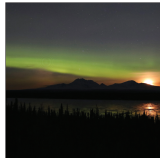
Moonrise In the Pass Winter Sunshine Wrangell Lights