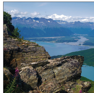
Golden Sunrise Always Hungry Ridge Over Solomon