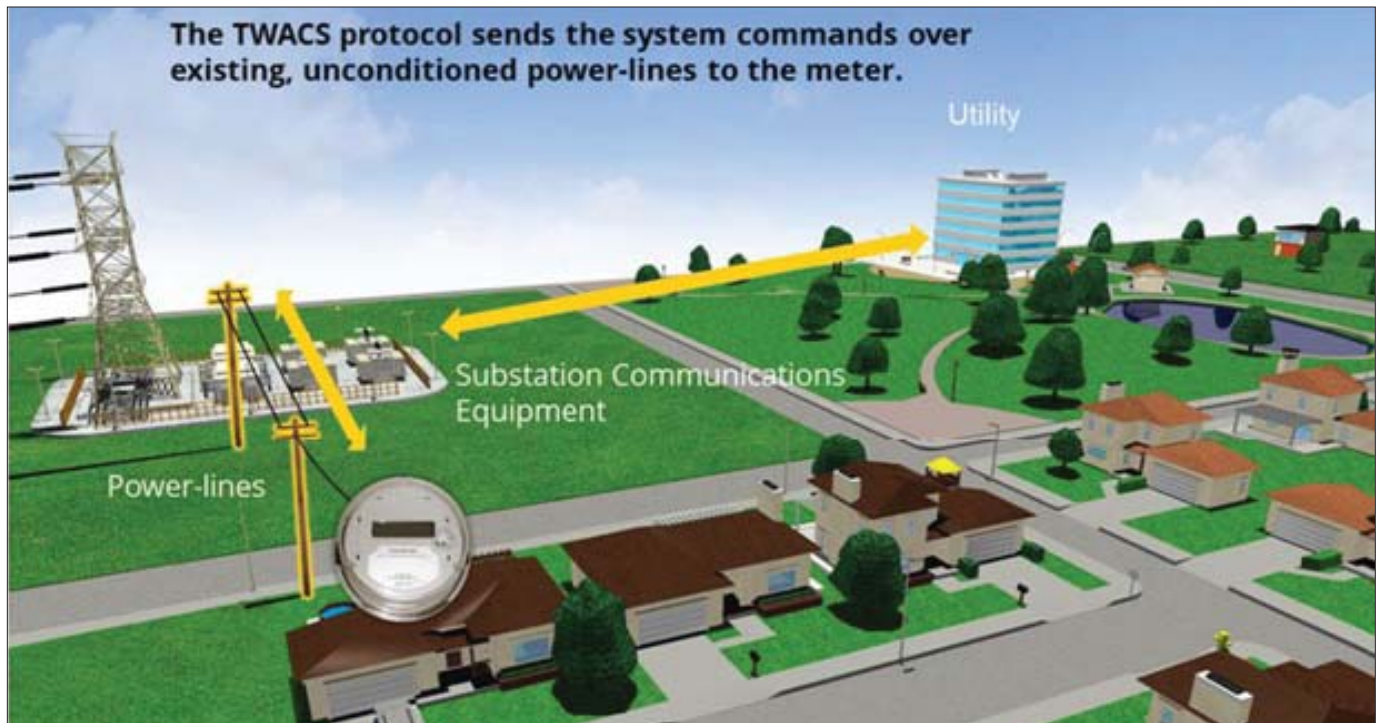
Above, the photo above depicts the flow of information using automated meters. Opposite, a picture of an automated meter, similar to what will be installed on the CVEA system

Copper Valley Electric Association will be installing new, automated meters over the next two years to increase the efficiency and reliability of the electric system in CVEA's service territory. Improving the efficiency of both operations and electricity delivery within the existing electric distribution system can help keep down costs for members.