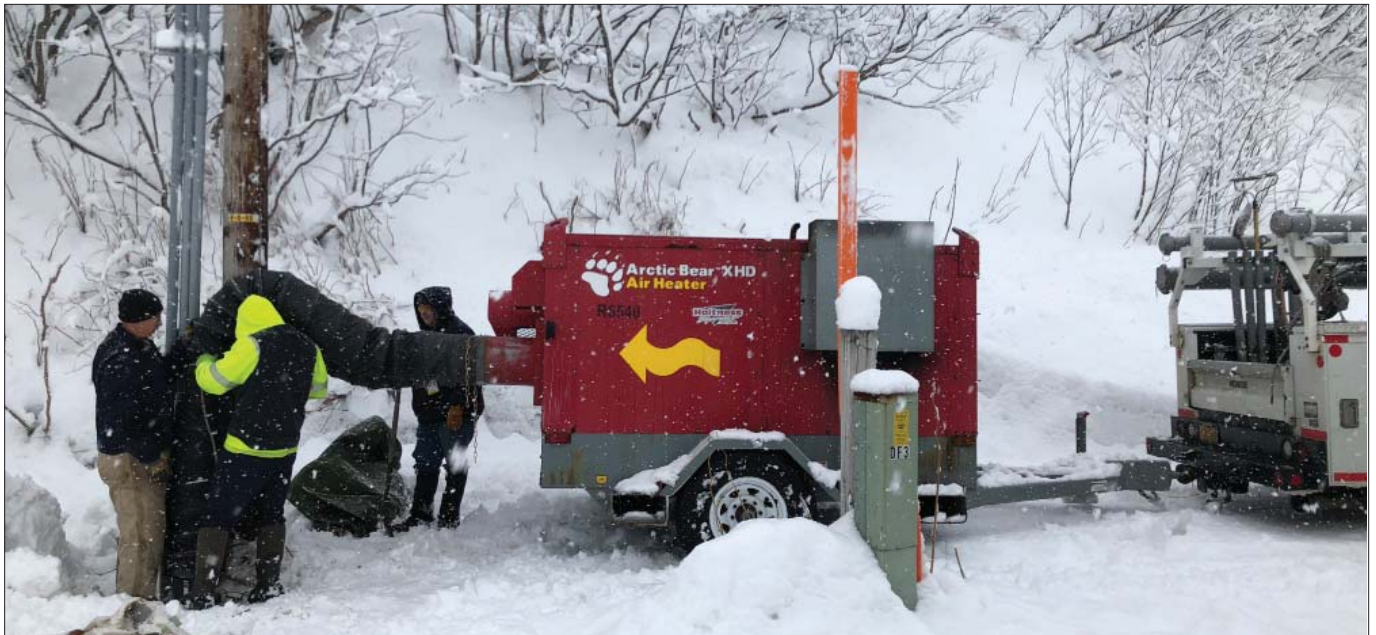
Above, crews using a heater to thaw the area around a power pole so it could be extracted and replaced

Since early 2015 Copper Valley Electric Association (CVEA) has been in discussions surrounding what it would take to serve additional loads on South Harbor Drive. During that time, multiple engineering studies were performed to determine what changes were necessary on the system to serve additional electrical load and still maintain reliability and system stability for the members of CVEA. It was determined that to accommodate the additional electric load required to operate the new Silver Bay Seafoods processing plant, the largest and most well known expansion taking place on South Harbor Drive, the distribution system required a number of upgrades.