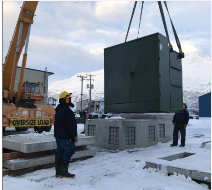
Left, crews replacing conductor to a newly set pole on Kobuk Drive Above, crews installing a new transformer at Silver Bay Seafoods

before their season began, making this project very unique.