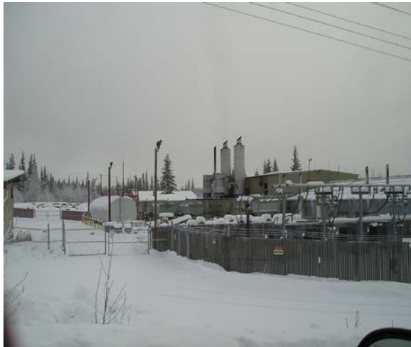
Glennallen Diesel Plant & Substation

Serving the Copper River Basin & Valdez Alaska