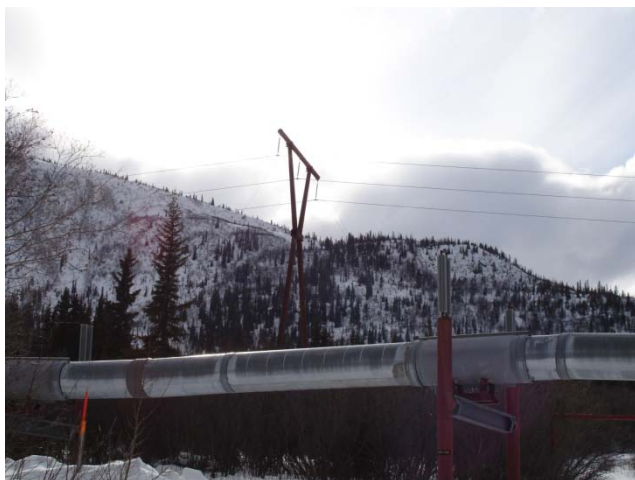
Transmission Line & Trans Alaska Pipeline