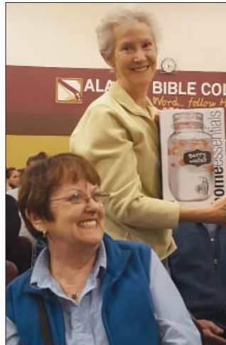
Members in Glennallen enjoying the door prize giveaways