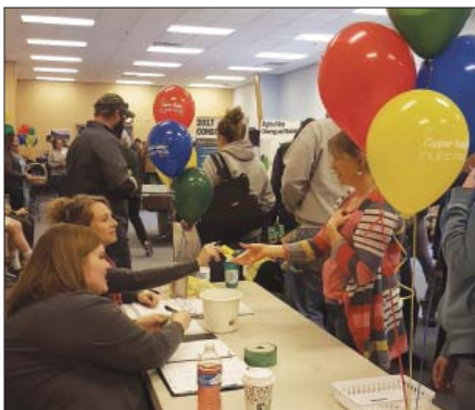
Members going through registration at the meeting in Glennallen