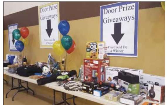
92 door prizes were given away at this year's annual meeting