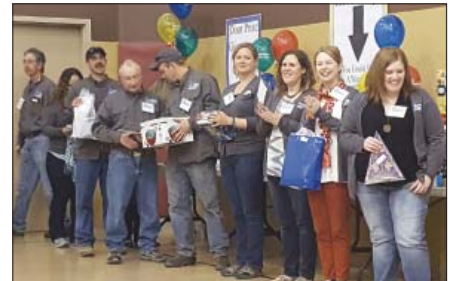
CVEA employees at the ready to distribute door prizes to members at the Copper Basin meeting