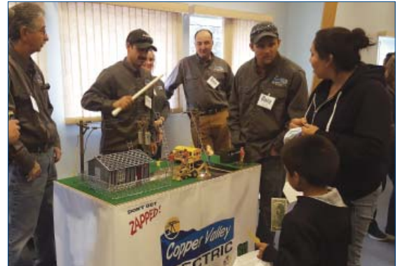
Copper Basin Lineman demonstrating the new Power Town electric safety model before the meeting