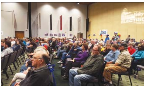
Approximately 250 people attended the meeting in Valdez