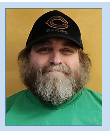
Tod Hand Copper Basin District