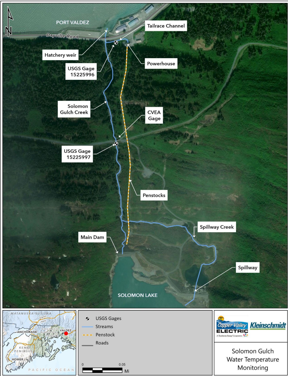
Figure 2-1. Water Temperature Monitoring Locations