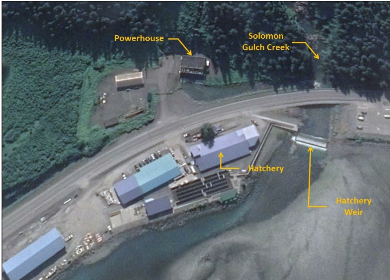
Photo 2-1. Solomon Gulch Hydroelectric Powerhouse and Tailrace, VFDA Hatchery, and the Mouth of Solomon Gulch Creek

Fish habitat in the Project area includes the lower reaches of Solomon Gulch Creek and the artificial tailrace channel. Approximately 90 percent of the flows released from Solomon Lake are used by the Solomon Gulch Project and routed through the penstocks and powerhouse into the tailrace. Water diverted for power generation draws the lake level down during winter months. In spring, the lake is refilled from snow and glacial melt. The lake begins to overtop the spillway in most years by early July. A minimum of 2 cubic feet per second (cfs) is released from Solomon Lake into Solomon Gulch Creek at all times for the protection of fish resources. A minimum release of 2 cfs is also maintained at the powerhouse into the tailrace channel.